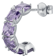
FMP13 € 28,00

925% sterling silver rhodium-plated hoop single earring with amethyst color cushion cubic zirconia.