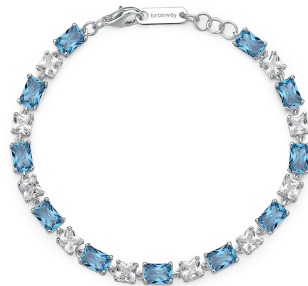
FFB16 € 161,00

925% sterling silver rhodium-plated bracelet with clear color cushion and sapphire color baguette cubic zirconia.