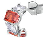
FVO08 € 28,00

925% sterling silver rhodium-plated hoop single earring with clear and orange color square and baguette cubic zirconia.