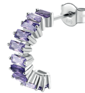
FMP12 € 28,00

925% sterling silver rhodium-plated hoop single earring with amethyst color baguette cubic zirconia.