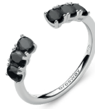
FMB11 € 45,00

925% sterling silver rhodium-plated ring with black color oval cubic zirconia.