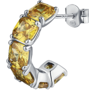
FEY08 € 34,00

925% sterling silver rhodium-plated hoop single earring with golden yellow color cushion cubic zirconia.