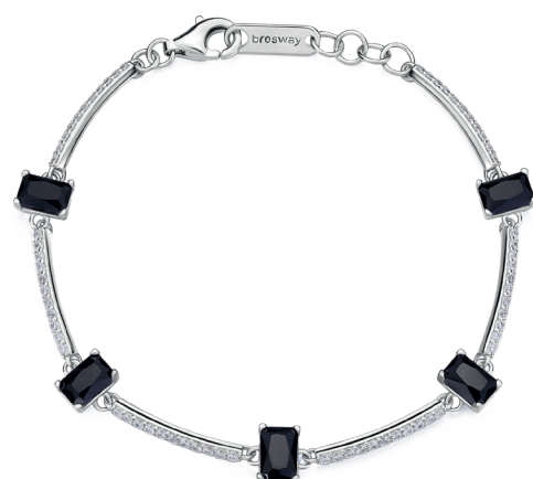
FMB05 € 87,00

925% sterling silver rhodium-plated bracelet with clear and black color baguette cubic zirconia.