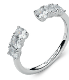
FIW18 € 45,00

925% sterling silver rhodium-plated ring with clear oval cubic zirconia.