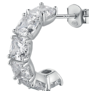
FIW15 € 28,00

925% sterling silver rhodium-plated hoop single earring with clear cushion cubic zirconia.