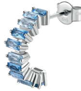
FCL10 € 34,00

925% sterling silver rhodium-plated hoop single earring with light sapphire color baguette cubic zirconia.