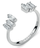
FIW17 € 45,00

925% sterling silver rhodium-plated ring with clear baguette cubic zirconia.