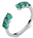
FLG10 € 51,00

925% sterling silver rhodium-plated ring with emerald color oval cubic zirconia.