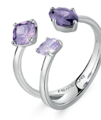
FMP16 € 51,00

925% sterling silver rhodium-plated ring with amethyst color cubic zirconia.