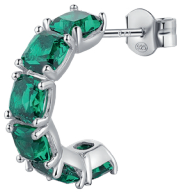
FLG08 € 34,00

925% sterling silver rhodium-plated hoop single earring with emerald color cushion cubic zirconia.