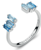
FCL12 € 51,00

925% sterling silver rhodium-plated ring with light sapphire color baguette cubic zirconia.