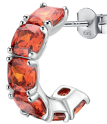
FVO10 € 34,00

925% sterling silver rhodium-plated hoop single earring with orange color cushion cubic zirconia.