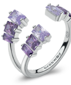
FMP17 € 57,00

925% sterling silver rhodium-plated ring with amethyst color baguette cubic zirconia.