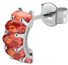
FVO09 € 28,00

925% sterling silver rhodium-plated hoop single earring with orange color oval cubic zirconia.