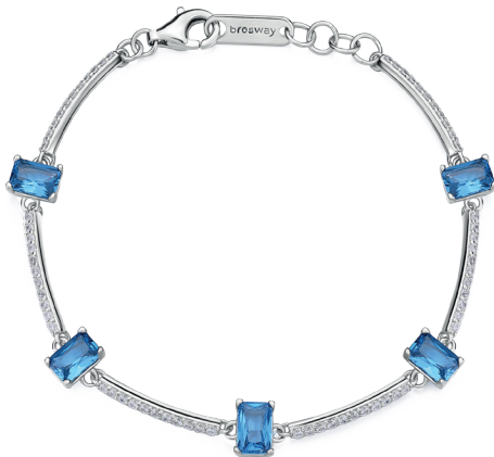
FFB04 € 92,00

925% sterling silver rhodium-plated bracelet with clear and sapphire color baguette cubic zirconia.