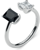
FMB10 € 39,00

925% sterling silver rhodium-plated ring with clear and black color baguette and square cubic zirconia.