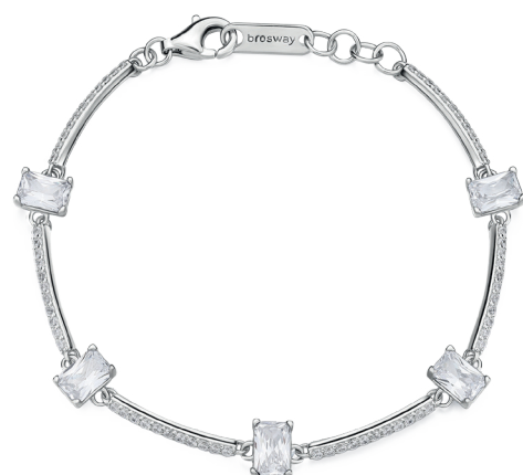
FIW06 € 87,00

925‰ sterling silver rhodium-plated bracelet with clear baguette cubic zirconia.