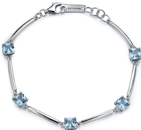
FCL05 € 80,00

925% sterling silver rhodium-plated bracelet with light sapphire color cushion cubic zirconia.