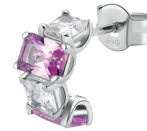
FVP08 € 28,00

925‰ sterling silver rhodium-plated hoop single earring with clear and light ruby color baguette and square cubic zirconia.