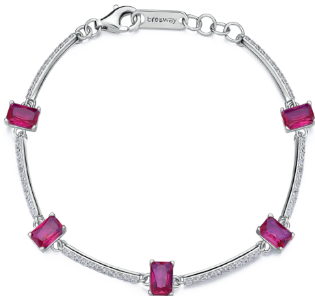
FPR04 € 92,00

925% sterling silver rhodium-plated bracelet with clear and ruby color cushion cubic zirconia.