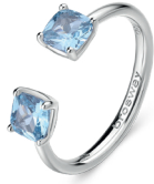
FCL11 € 45,00

925% sterling silver rhodium-plated ring with light sapphire color cushion cubic zirconia.