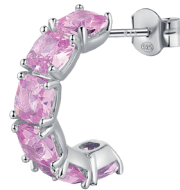
FVP10 € 34,00

925‰ sterling silver rhodium-plated hoop single earring with light ruby color cushion cubic zirconia.