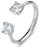
FIW16 € 39,00

925% sterling silver rhodium-plated ring with clear cushion cubic zirconia.