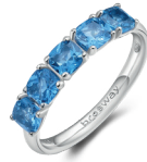
FFB14 € 51,00

925% sterling silver rhodium-plated ring with sapphire color cushion cubic zirconia.