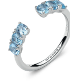
FCL13 € 51,00

925% sterling silver rhodium-plated ring with light sapphire color oval cubic zirconia.