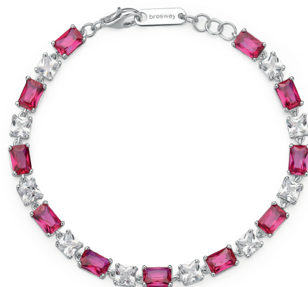
FPR18 € 161,00

925% sterling silver rhodium-plated bracelet with clear color cushion and ruby color baguette cubic zirconia.