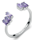
FMP15 € 45,00

925% sterling silver rhodium-plated ring with amethyst color baguette cubic zirconia.