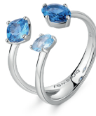
FFB10 € 57,00

925% sterling silver rhodium-plated ring with sapphire color cubic zirconia.