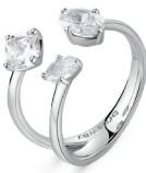
FIW19 € 51,00

925% sterling silver rhodium-plated ring with clear cubic zirconia.