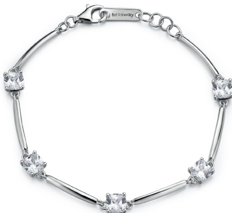
FIW05 € 75,00

925‰ sterling silver rhodium-plated bracelet with clear cushion cubic zirconia.