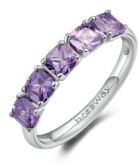
FMP24 € 68,00

925% sterling silver rhodium-plated ring with amethyst color cushion cubic zirconia.