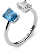
FFB09 € 45,00

925% sterling silver rhodium-plated ring with clear and sapphire color baguette and square cubic zirconia.