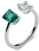
FLG09 € 45,00

925% sterling silver rhodium-plated ring with clear and emerald color baguette and square cubic zirconia.