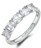
FIW25 € 45,00

925% sterling silver rhodium-plated ring with clear color cushion cubic zirconia.