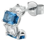
FFB08 € 28,00

925% sterling silver rhodium-plated hoop single earring with clear and sapphire color baguette and square cubic zirconia.