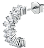
FIW14 € 28,00

925% sterling silver rhodium-plated hoop single earring with clear baguette cubic zirconia.