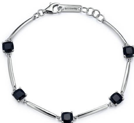
FMB04 € 75,00

925% sterling silver rhodium-plated bracelet with black color cubic zirconia.