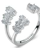
FIW20 € 57,00

925% sterling silver rhodium-plated ring with clear baguette cubic zirconia.