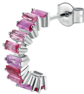
FVP09 € 34,00

925‰ sterling silver rhodium-plated hoop single earring with light ruby color baguette cubic zirconia.