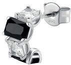
FMB09 € 26,00

925‰ sterling silver rhodium-plated hoop single earring with clear and black color baguette and square cubic zirconia.