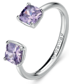
FMP14 € 39,00

925% sterling silver rhodium-plated ring with amethyst color cushion cubic zirconia.